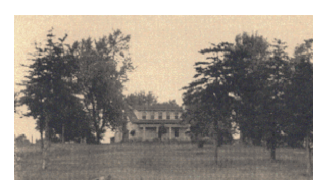
The Hood Family Home