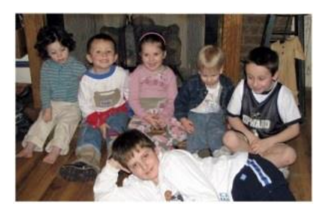
The Brown grandchildren